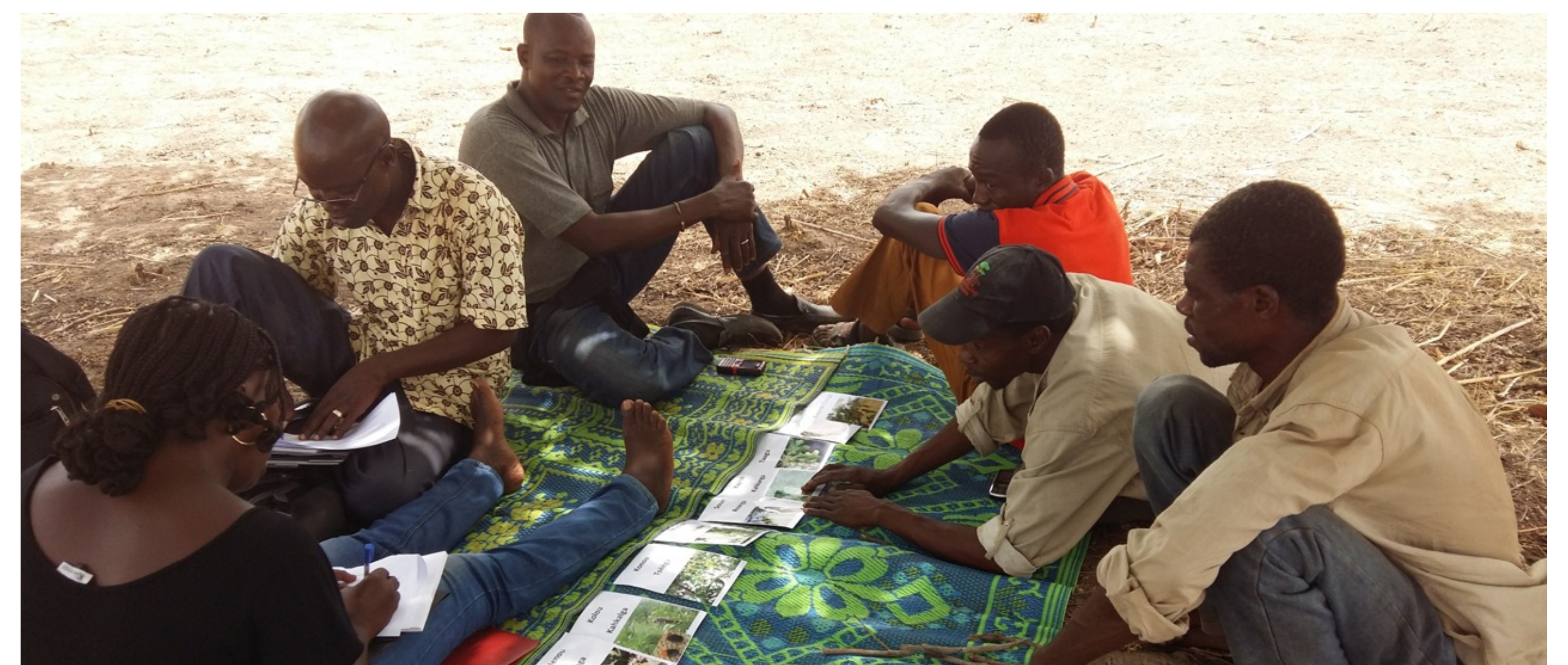
Plate 1. Ranking attribute survey with farmers in West African parkland systems in Vlassan, Ziro Province, Burkina Faso

Led to a change in the attitudes and knowledge around tree planting by stakeholders , with an important shift away from the promotion of a handful of exotic tree species in woodlots, largely benefiting wealthier men, to recommendations for over 70 tree species, 30 of them native, with management practices that addressed the needs of women, various ethnic groups and different types of farmers.