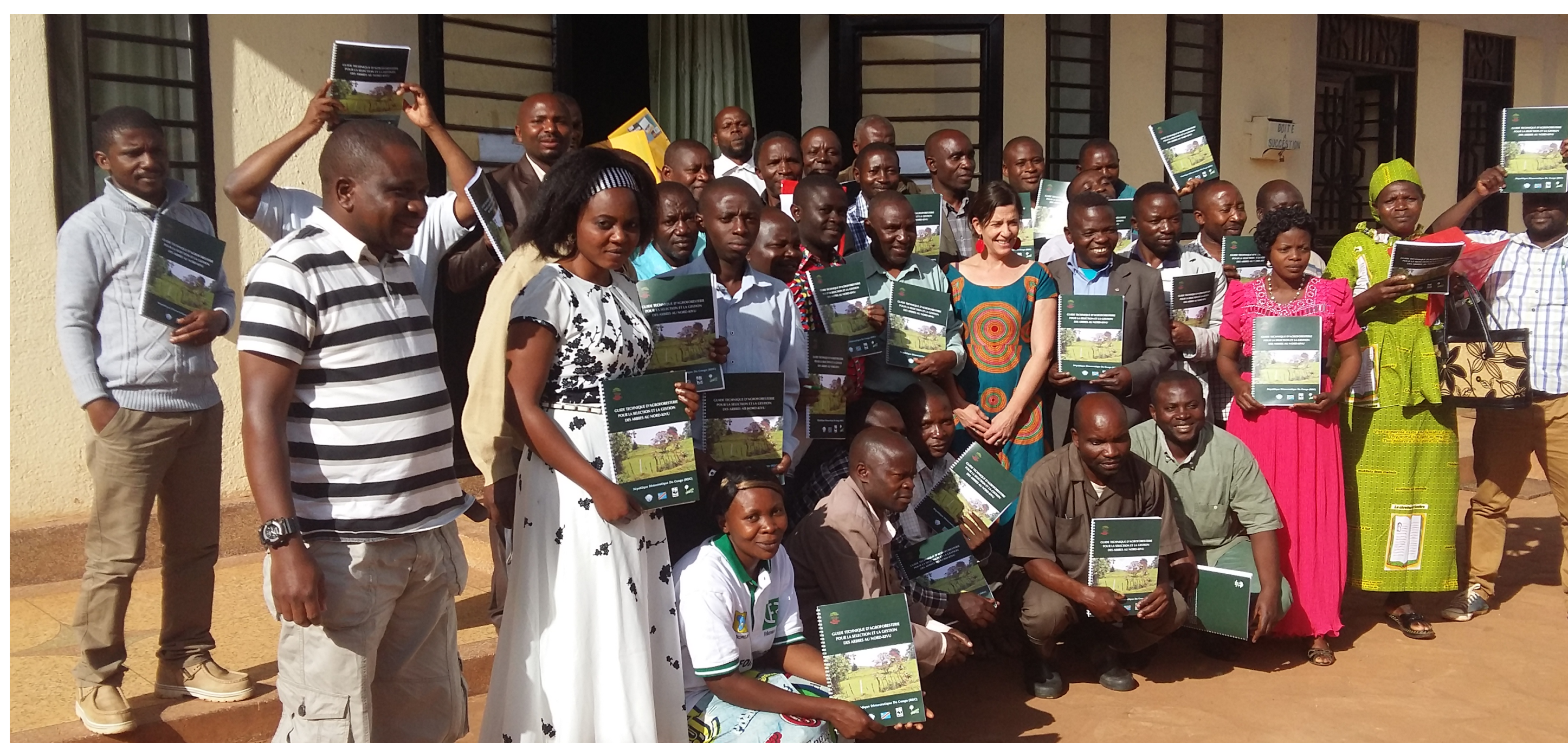
Plate 2. Extension agents and representatives of farmers’ groups with their customized agroforestry manual that built on local and scientific knowledge in Butembo, North-Kivu DRC